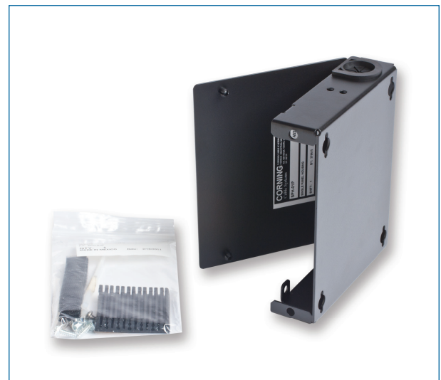
Single-Panel Housing (open) | Photo LAN3513