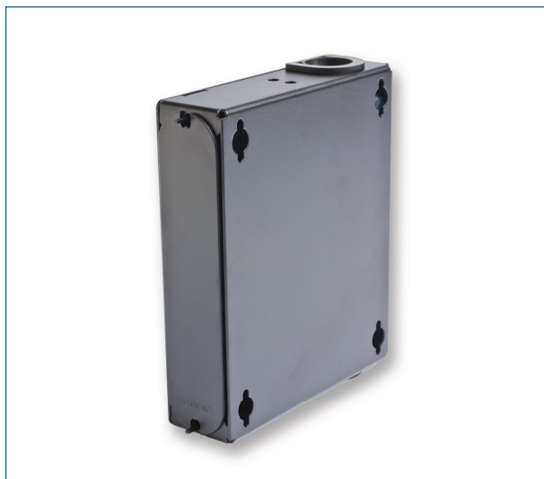
Single-Panel Housing | Photo LAN3536

This compact unit has a 1.5-in frontal projection and is optimized for use in locations such as building entrance terminals, wiring closets, open office and other controlled environments where space is a premium. The durable black metal housing can be used for splice management, cross-connect or both for up to 12 heat-shrink splices. Top and bottom cable entry grommets are provided for mid-span access and environmental sealing, creating an effective solution for customer premises or remote locations.